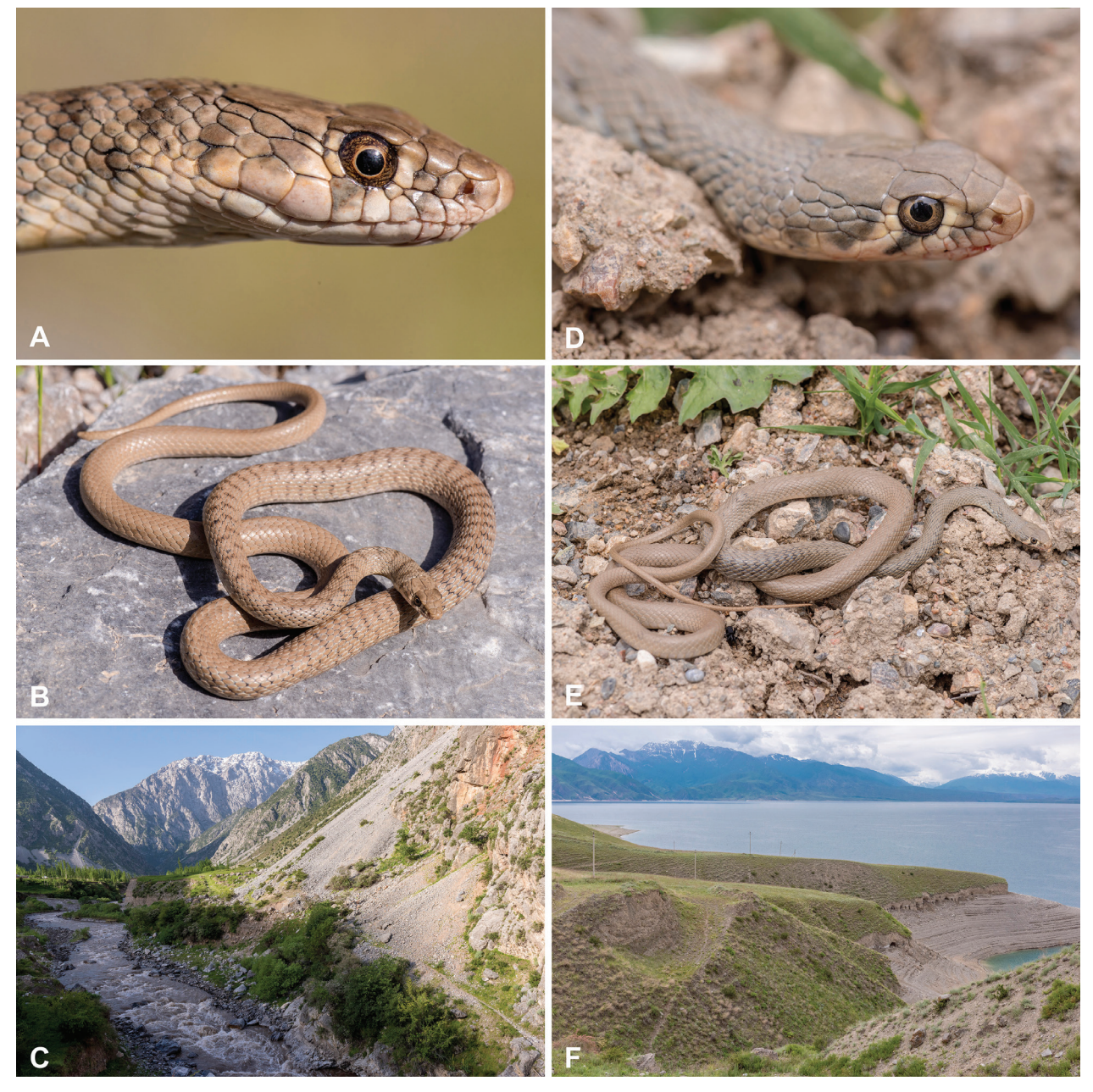
Figure 2. Platyceps rhodorachis from Kyrgyzstan: A-C. adult male from the locality Vidana, Osh Province and its habitat; D-F. adult female from Imeni Chkalova, Jalal-Abad Province and its habitat around Toktogul reservoir.