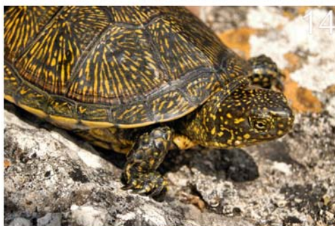
Figs. 9–14. The amphibians and reptiles in the localities where they were recorded in Albania. 9 – Triturus macedonicus (Karaman, 1922), male, Shelegurë. 10 – Bufo viridis complex (Laurenti, 1768) male, Ardenica. 11 – Pelophylax cf. epeiroticus (Schneider, Sofianidou & Kyriakopoulou-Sklavounou, 1984), juvenile, Butrint. 12 – Rana graeca Boulenger, 1891, Drenovë. 13 – Pelophylax cf. shqipericus (Hotz, Uzzell, Günther, Tunner & Heppich, 1987), male, Lake Skadar. 14 – Emys orbicularis (Linnaeus, 1758), female, Butrint.