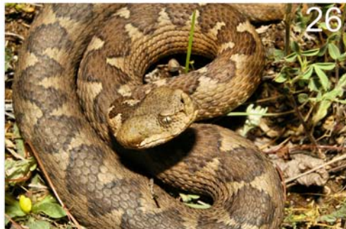
Figs. 21–26. The reptiles in the localities where they were recorded in Albania. 21 – Podarcis tauricus (Pallas, 1814), Diviakë. 22 – Anguis graeca Bedriaga, 1881, Llogarë. 23 – Typhlops vermicularis Merrem, 1820, Ardenica. 24 – Platyceps najadum (Eichwald, 1831), male, Llogarë. 25 – Malpolon insignitus (Geoffroy, 1827), juvenile, Diviakë. 26 – Vipera ammodytes (Linnaeus, 1758), female, Shelegurë.