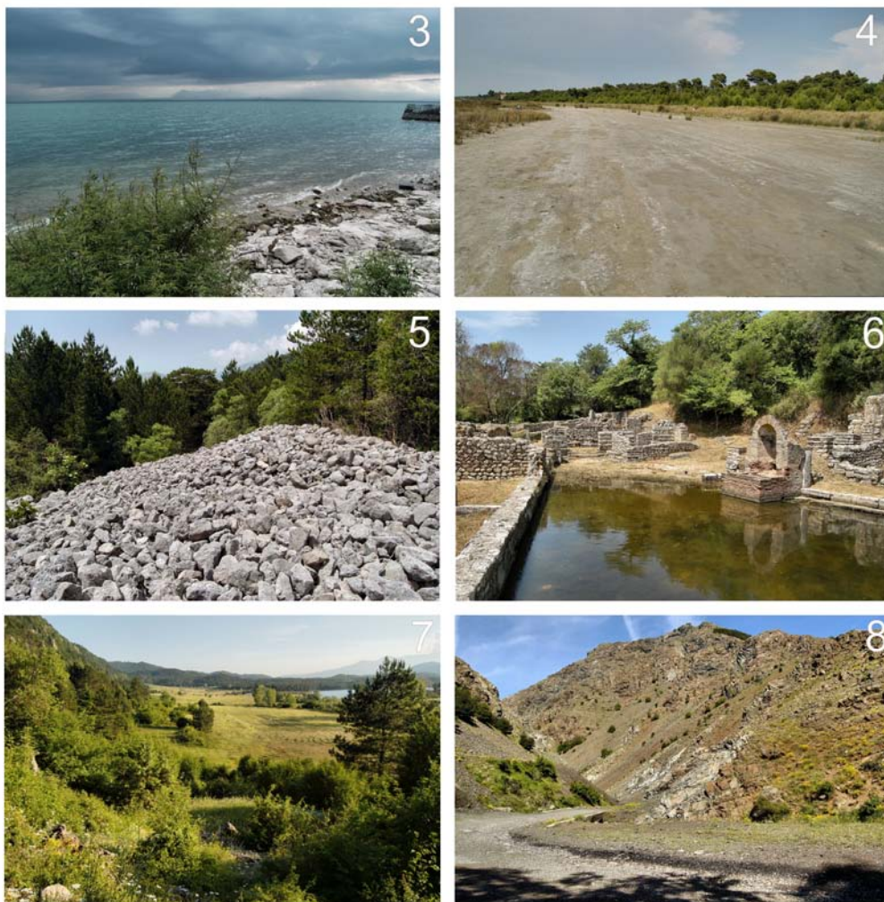
Figs. 3–8. The localities and habitats in Albania that were investigated. 3 – Littoral of the Lake Skadar (locality No. 1). 4 – Diviakë in Karavastasë (No. 4). 5 – Llogarë (No. 7b) where Anguis graeca , Algyroides nigropunctatus , Podarcis muralis and Vipera ammodytes were found. 6 – Habitat at Butrint (No. 10a) where Emys orbicularis and Mauremys rivulata were found. 7 – A general view of the biotope Shelegurë, 1032 m a. s. l. (No. 15). 8 – A view of the locality Drenovë, 1143 m a. s. l. (No. 17).

RECORDS. Ardenica cloister, 43 m a. s. l.: 3 adult specimens (Fig. 10); Butrint Lake, 1 m a. s. l.: 2 juvenile individuals. OCCURRENCE. Common Albanian species occurring mainly in lowland areas in the Western Depression and also high in the mountains (Haxhiu 1994). Sensus Stöck et al. 2009 in Albania occurs Bufo variabilis (Pallas, 1769). DISTRIBUTION. It is a species complex (Stöck et al. 2006) distributed from North Africa, across the Mediterranean, central and south Europe to west Asia and Mongolia. COMMENTS. The surroundings of the localities were sandy and dry.