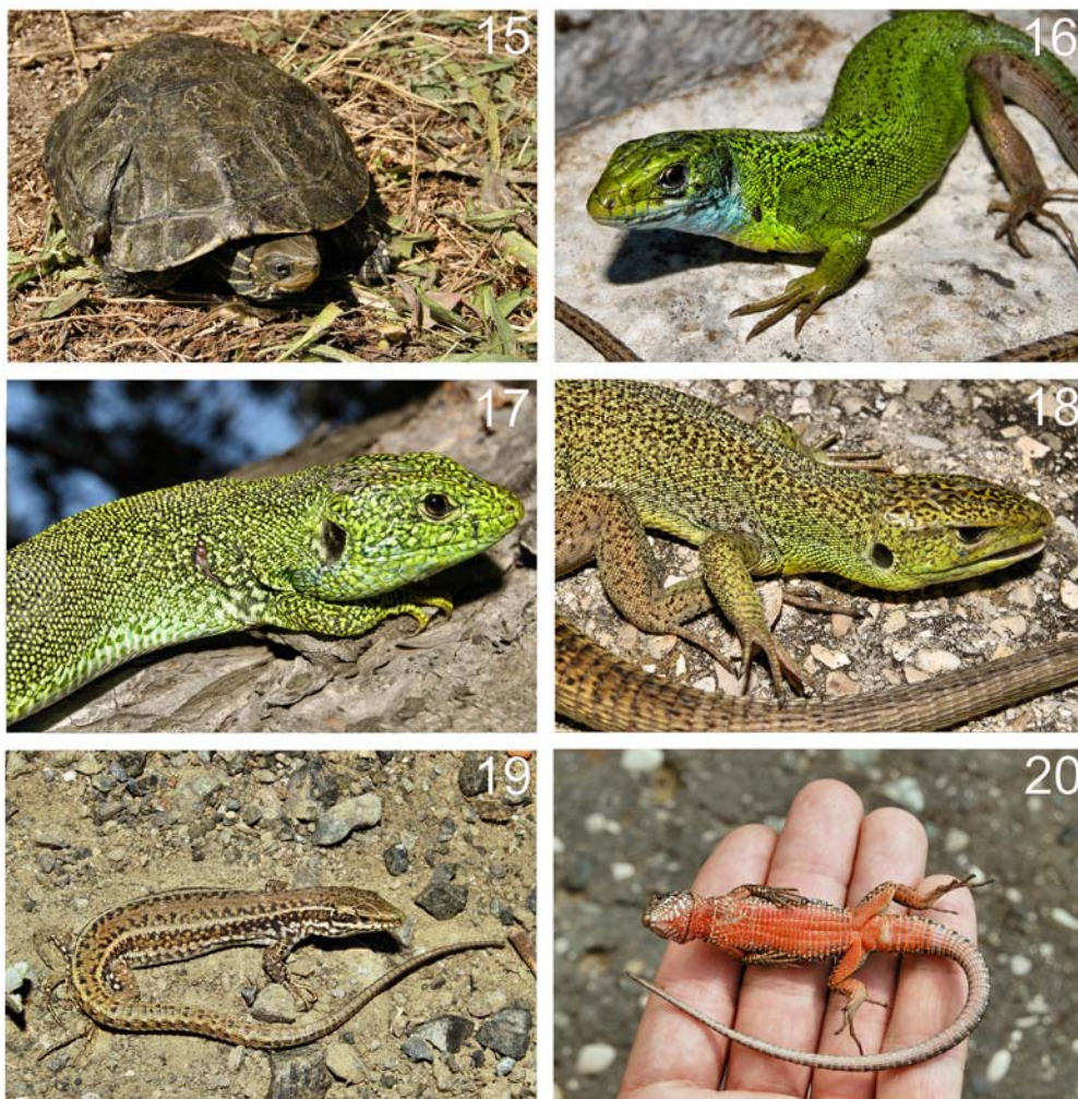
Figs. 15–20. The reptiles in the localities where they were recorded in Albania. 15 – Mauremys rivulata (Valenciennes, 1833), Butrint. 16 – Lacerta viridis complex, female, Llogarë. 17 – Lacerta viridis complex, male, Drenovë. 18 – Lacerta trilineata Bedriaga, 1886, female, Himarë. 19 – Podarcis erhardii (Bedriaga, 1882), male, Drenovë. 20 – Podarcis muralis (Laurenti, 1768), Shelegurë.

OCCURRENCE. Common species from sea level up to 1000 m a. s. l. (Haxhiu 1998).