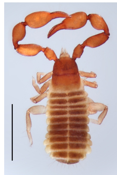
Figure 2. Lamprochernes chyzeri male recorded from Macedonia. Scale: 1 mm.

rula exterior with 15 blades; small, largely unsclerotized teeth situated on both movable and fixed fingers. Palps: slender, finely granulate; protuberance on palpal trochanter conical and pointed; chelal fingers with 12 trichobothria (eight on fixed and four on movable chelal finger), subterminal trichobothrium on movable chelal finger situated