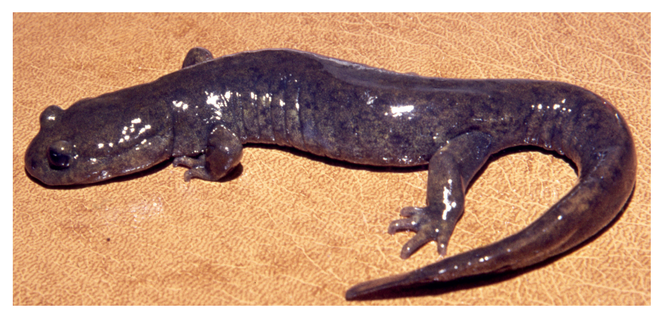
Fig. 3. Adult specimen of Paradactylodon (Afghanodon) mustersi kept alive in Bonn.

two names, by Dubois & Raffaëlli (2012), the one for our species here being Afghanodon. The genus concept is to unite (monophyletically) related species, thus giving information on phylogenetic relationship, while monotypic genera are merely a prefix of a single species name (Richter 1943). Here, we maintain Paradactylodon and group Afghanodon only as a subgenus of the Afghan endemic brook salamander which is sufficient to express its long evolutionary isolation from the Iranian congener. One character in the short and only tabular diagnosis of Afghanodon and its Iranian fellow (sub)genus Iranodon was an abbreviation for the "adaptability in terrarium": HAT (high) for the latter, and LAT (low) for the former, certainly a weak diagnostic character for a new genus name. Moreover, several reports have shown, that also P. (A.) mustersi is well adaptable to captive conditions (Mertens 1970; Seufer 1974; Sparreboom 1977, 1978; Böhme 1982) and yielded several natural history data (food intake by tongue protrusion, partial terrestriality, reproductive behavior) obtained by these authors from specimens kept in aqua-terraria.