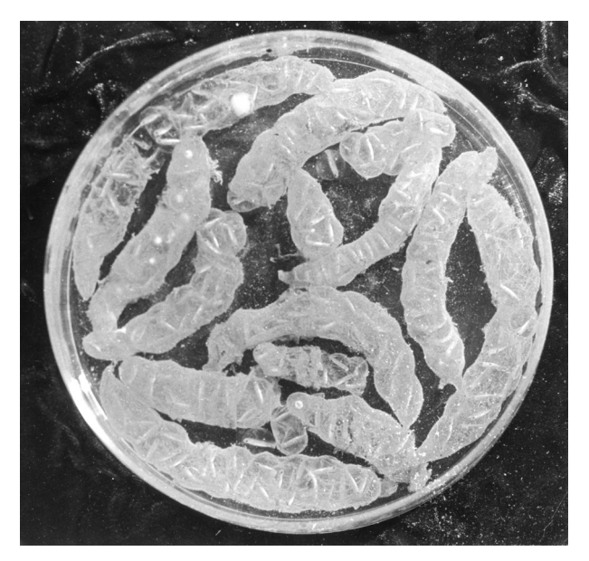
Fig. 1. (Fig. 2 in the original paper). Egg sacs of Paradacty-lodon (Afghanodon) mustersi with developing larvae.