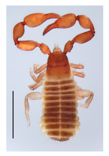
Figure 2. Lamprochernes chyzeri male recorded from Macedonia. Scale: 1 mm.

rula exterior with 15 blades; small, largely unsclerotized teeth situated on both movable and fixed fingers. Palps: slender, finely granulate; protuberance on palpal trochanter conical and pointed; chelal fingers with 12 trichobothria (eight on fixed and four on movable chelal finger), subterminal trichobothrium on movable chelal finger situated